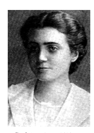
Fig. 1. Łucja Frey in 1918

Her subsequent dissertation was abridged in collaboration with Olaf Michel and published under the title The Woman behind Frey'Syndrome: The Tragic Life of Lucja Frey [2]. Both these works were a basis for this study [1,2].