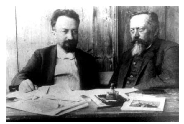
Fig. 2. Napoleon Cybulski and Adolf Beck (left)

of changes in the cortical potential at various sites within the cortex, they mapped cortical regions which are responsible for sensory perception. They also showed that the amplitude of the evoked cortical potential was affected both by the strength and nature of the sensory stimulus, and by the depth of the animal's anaesthesia. Based on these findings, a hypothesis was put forth that activities of the central nervous system are associated with bioelectric activity of cortical neurons. Polish physiologists did not know Richard Caton's earlier investigations of variation in bioelectric activity of the dog's brain cortex during sleep, wakefulness and cessation of functions. Beck's and Cybulski's works were undoubtedly novel in that the two researchers used standardized stimuli to elicit activity and their methodology for mapping the cortical area was based on the amplitude of the evoked electric potential. A completely novel approach was also adopted by Adolf Beck for his research into the bioelectric activity of the frog's spinal cord. Beck presented results of his studies in his PhD dissertation on 'Identification of locations in the brain and spinal cord using electric phenomena' in 1890.